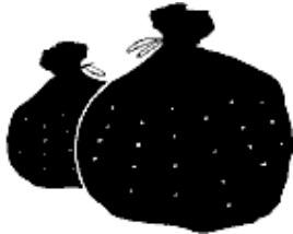
Black plastic sacks filled with leaves